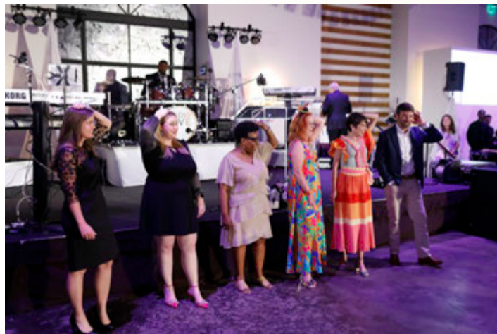
Guests in the final rounds of our Heads or Tails game competing to win a diamond necklace from Diamonds Direct.