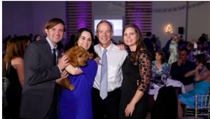
The Gentle family with a special furry guest.